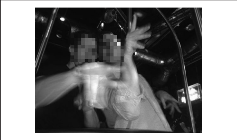
Figure 5. Men dancing together.

Figure 5 shows two men in a club dancing together. The blur on the photo shows that they have made little attempt to stop dancing for the photograph although they may have lent in toward each other for the benefit of the photo.