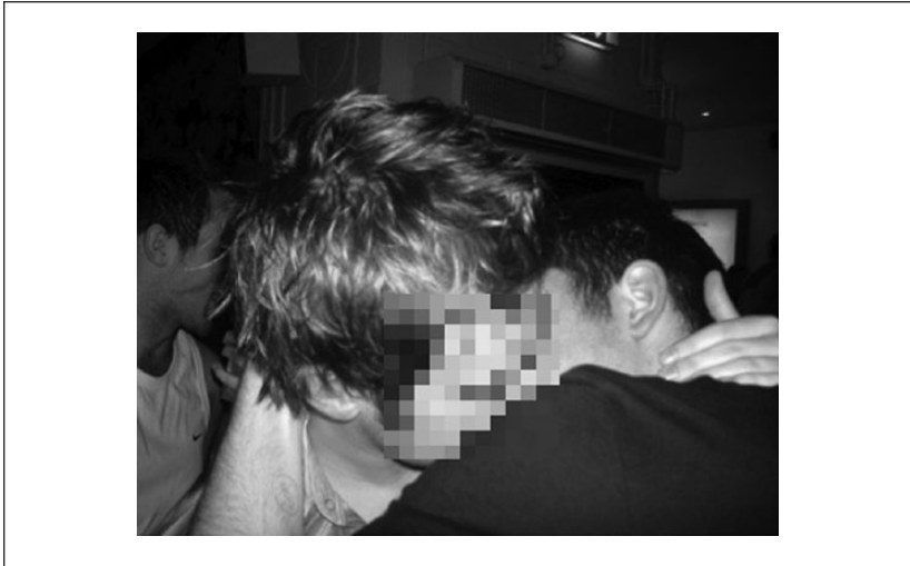
Figure 3. Two men kissing.

displaying photos of them kissing another male (18 photos in total), the presence of any photos of this nature is extremely significant because of the homosexual overtones associated with male kissing (Anderson et al., 2012). In addition, kisses often happen quickly, so it is unlikely that all instances would have been caught on camera.