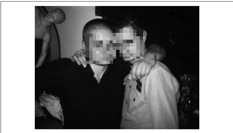
Figure 1. Men posing for a photograph.

While these types of tactile behaviors were sometimes displayed between men and women (heterogeneous tactility), in line with Mendelson and Papacharissi's (2011) findings, they were most commonly found between men (see Table 1). Exemplifying this, only six of the profiles examined featured more photos of heterosocial tactility (men being tactile with just women) than homosocial tactility.