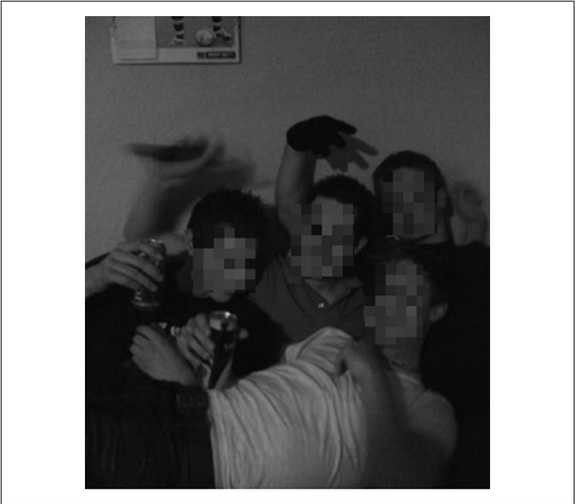
Figure 2. Group of men cuddling and drinking alcohol.

a girlfriend, whereupon this became a focus for a large proportion of photographs. Six participants from the 44 had girlfriends (no participants identified as gay), and the mean number of homosocially tactile photos on their profile was 3. When these 6 participants are taken out of the sample, the homosocial mean for each of the remaining (single) participants rises to 6.8 (see Table 1).